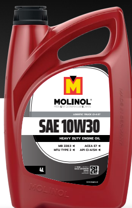
TDS 140201301 Heavy Duty Engine Oil API CI-4/SH - ACEA E7

This product is a high-performance diesel engine oil that is developed according to one of the latest emission regulations. This product is suitable for heavily loaded diesel engines. The product can be used in modern diesel engines of trucks, buses, off-road equipment and other heavy-duty materials. This product is highly recommended for diesel engines that meet EURO I, EURO II, EURO III, EURO IV and EURO V emission requirements. It can be used in vehicles with or without DPF filters and is also applicable in vehicles with SCR NOx reduction systems. It is an excellent product that performs well under extreme operating conditions and increases the lifetime of the equipment. This is a perfect product for the complete fleet.