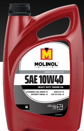
TDS 140201701 Heavy Duty Engine Oil API CI-4/SL - ACEA E7

This is a synthetic heavy duty truck engine oil that as very high TBN additives compared to other CI-4 engine oils. This results into extreme engine protection to trucks, off-road equipment and construction vehicles. This product is suitable for European as well as American gasoline and diesel engines and ensures emission norms EURO II, EURO III, EURO IV are met (not suitable for vehicles with DPF). This product is suitable for the whole fleet, offers a very good stability and keeps the engine very clean.