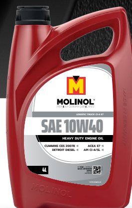
TDS 140201401 Heavy Duty Engine Oil API CI-4/SL - ACEA E7

This product is a high-performance semi-synthetic diesel engine oil that is developed according to one of the latest emission regulations. This product is suitable for heavily loaded diesel engines. The product can be used in modern diesel engines of trucks, buses, off-road equipment and other heavy-duty materials. This product is highly recommended for diesel engines that meet EURO I, EURO II, EURO III, EURO IV and EURO V emission requirements. It is an excellent product that performs well under extreme operating conditions and increases the lifetime of the equipment. This is a perfect product for the complete fleet.