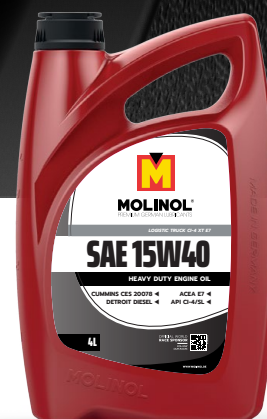
TDS 140201801 Heavy Duty Engine Oil API CI-4/SL - ACEA E7

This is a heavy duty truck engine oil that as very high TBN additives compared to other CI-4 engine oils. This results into extreme engine protection to trucks, off-road equipment and construction vehicles. This product is suitable for European as well as American gasoline and diesel engines and ensures emission norms EURO II, EURO III, EURO IV are met (not suitable for vehicles with DPF). This product is suitable for the whole fleet, offers a very good stability and keeps the engine very clean. It is particularly suited for use with lower quality fuels, with high sulphur content.